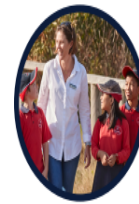
Build skills through fun